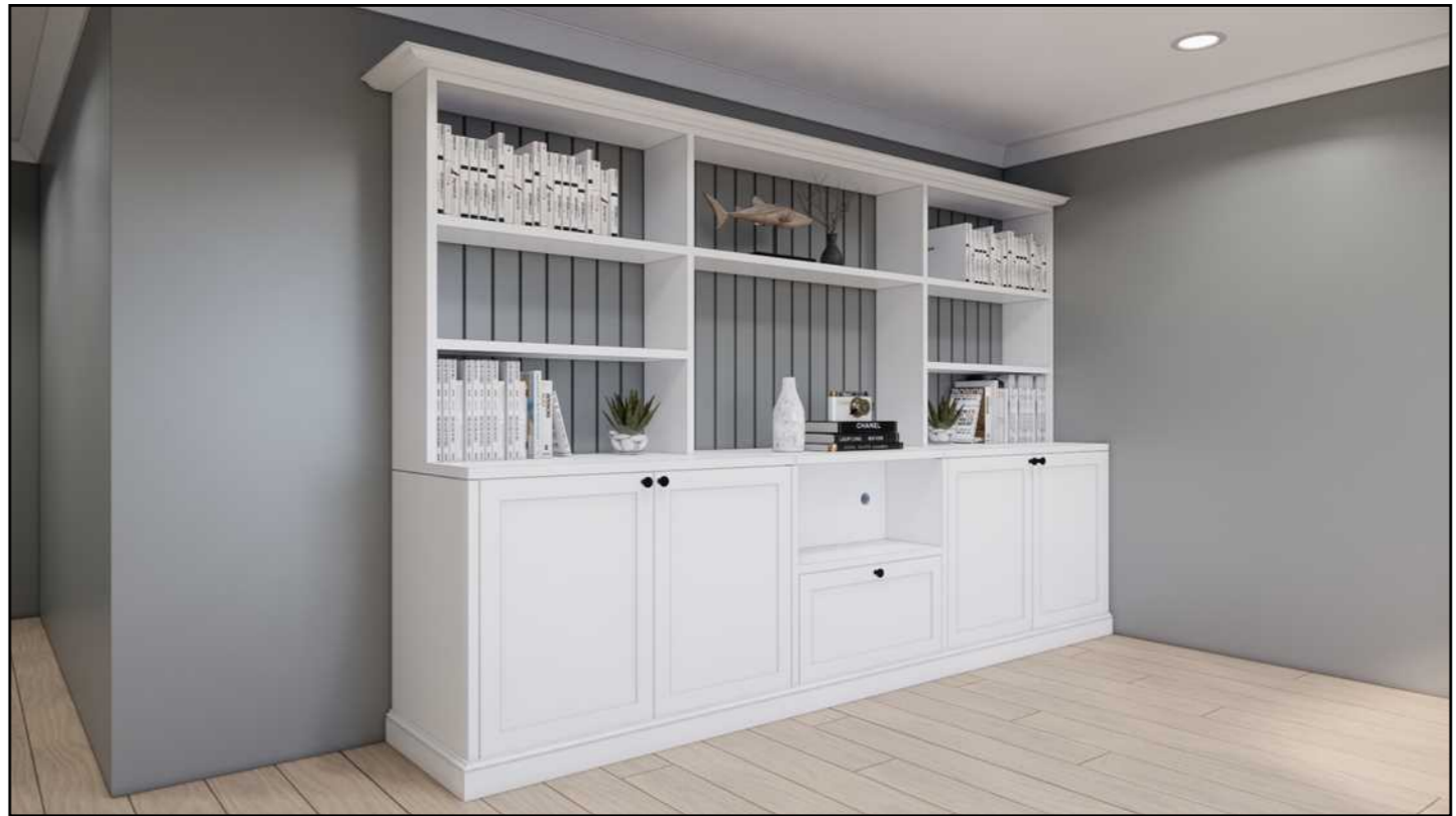
BOOKCASE PERSPECTIVE 2 AI Scale: NTS