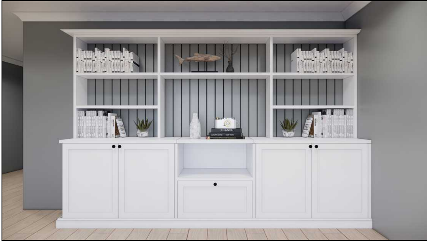
AI BOOKCASE PERSPECTIVE 1 Scale: NTS