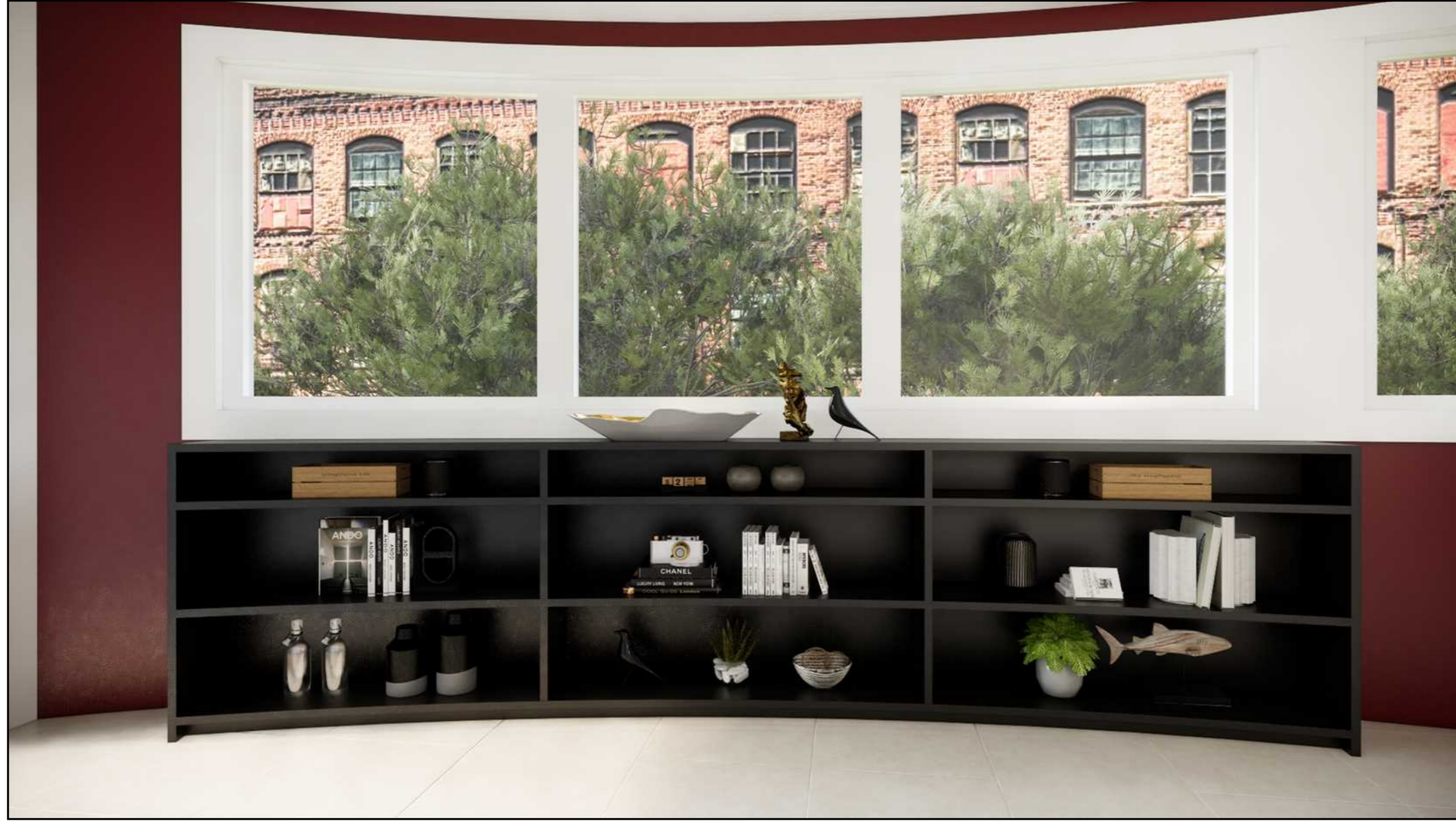
AI BOOKCASE Scale: NTS

DESIGNED BY SHAI ZEEV ABN: 47 640 715 279 6b Larman St, Bentleigh East 3165 Mob: 0407004576 E-mail: sales@thecabinetmerchant.com.au