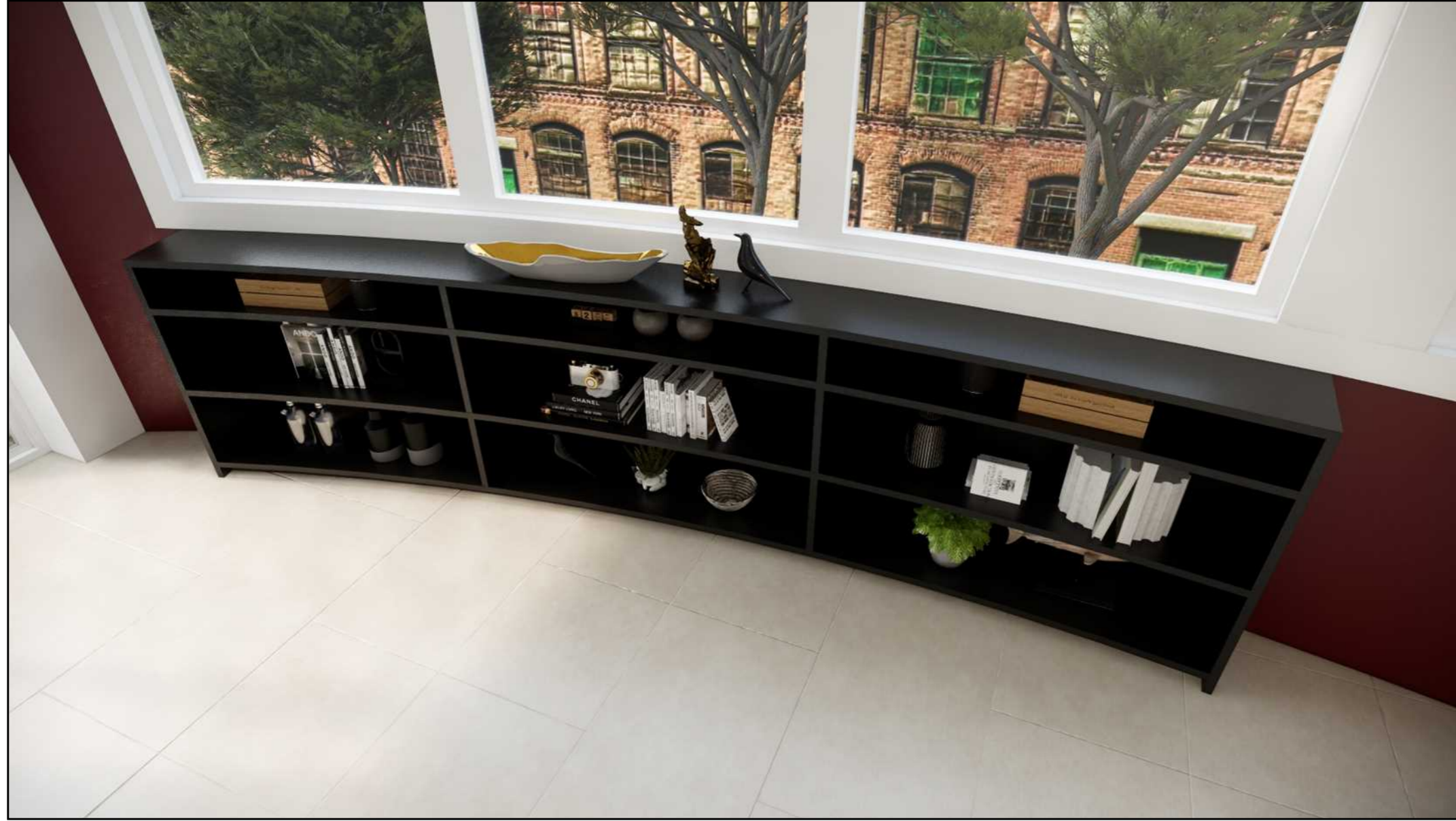
AI BOOKCASE Scale: NTS